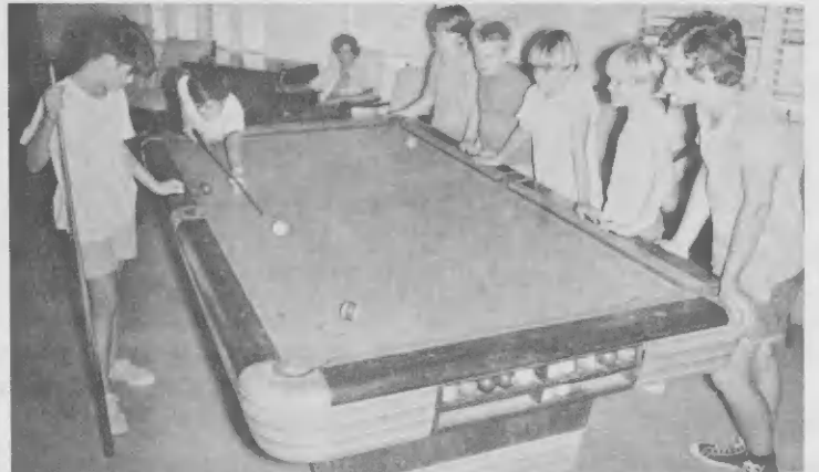
Swimming instructions for the younger set (above), while an older group enjoy themselves at the billiard table.